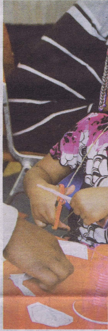
Saturday, May 14, 2011; Cleveland Avenue: Students from the Supporting Partnerships to Assure Ready Kids (SPARK) pre-kindergarten program participated in a day of fun activities at Clark Elementary SPARK program, w